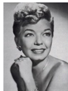
The Frances Langford Foundation