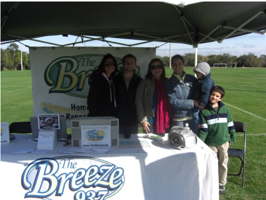
The Breeze 93.7