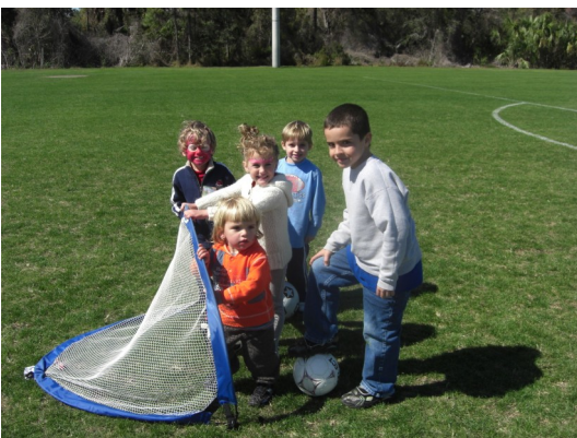
Martin County children enjoying soccer at the event!