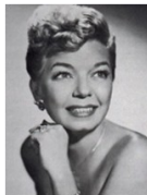
The Frances Langford Foundation