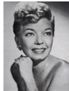
The Frances Langford Foundation