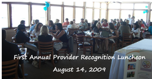
First Annual Provider Recognition Luncheon August 14, 2009

To see more images from our First Annual Provider Networking Luncheon, please visit: